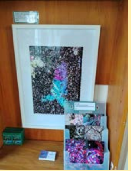
Wanted: Material for the club sales table. Donations needed, please.

Geobusters next meeting: July 14 1 to 3 pm. This will be using the nicro-eye and florescent minerals.