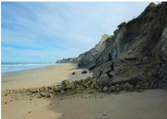
One should be mindful, as fresh rockfalls can be hazardous, as shown above.