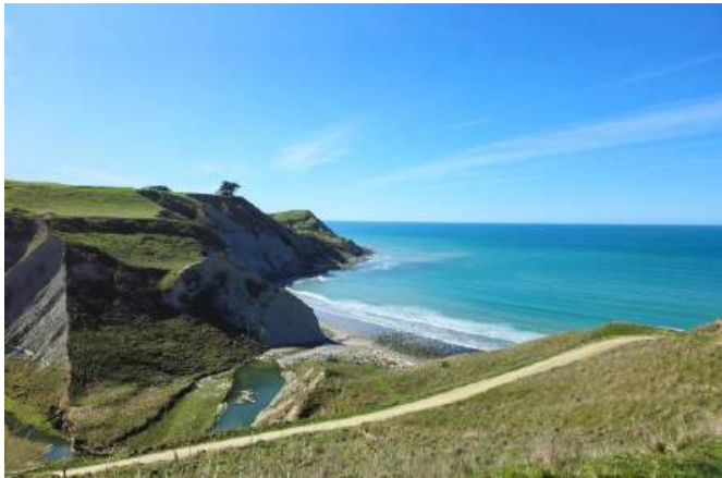
A glorious day at Glenafric beach in North Canterbury.

Photos from the September field trip to Glenafric The recent field trip to Glenafric was successful for all! Not only was fantastic weather assured, but everybody who attended walked away with keepers. This included fossil Gastropods, several species of crabs, Flabellum coral, as well as a few pieces of unidentified bone.