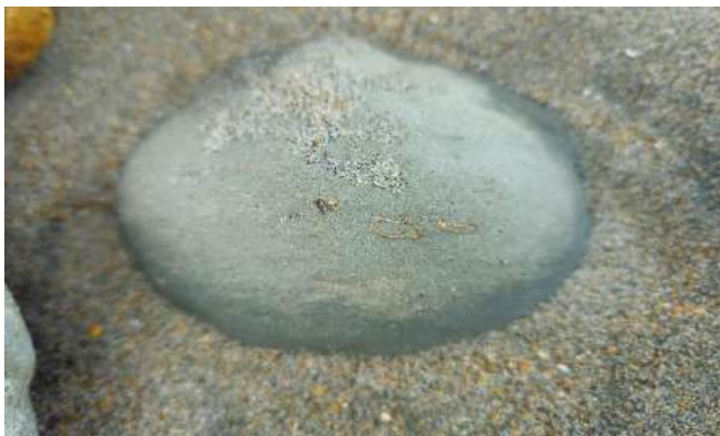
Here lays a fresh fossil Tumidocarcinus giganteus crab concretion with three legs exposed. A prized find that had tumbled recently from the cliffs above.